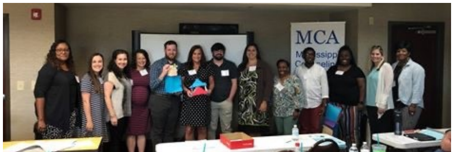
2019-20 MCA Emerging Leaders